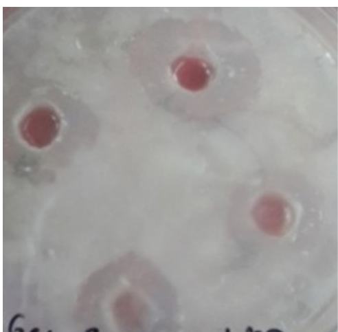
Fig. 1. Anti-dandruff activity of Distilled cow urine M. furfur .