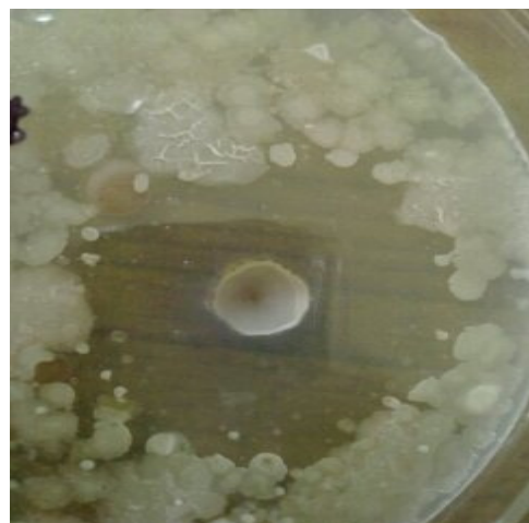
Fig. 4. Antidandruff activity of Ketoconazole against M.furfur .