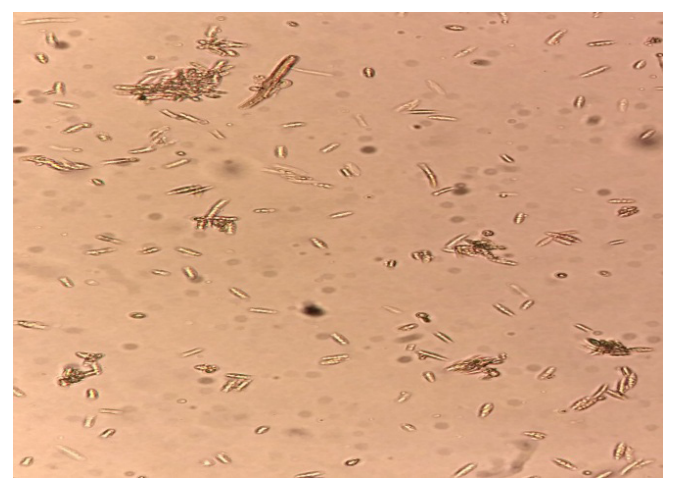
Fig. 2. Conidia of Achersonia aleyrodis

Districts Hoshiarpur, Ludhiana, Mansa and Fazilka of Punjab. This fungal growth on the citrus whitefly, D. citri, nymphs and pupae was identified as an EPF, Aschersonia aleyrodis. The growth of this fungus on the SDYA medium was fast with filamentous hyphae, white to yellowish white, with a peripheral circle. The colour of the conidial mass varied from light yellowish orange to reddish orange (Figure 1). Anamorphic stroma was observed as thin pulvinate structure along with hypothallus. Conidiomata 5-15 per stroma, conidiogenous cells arise singly or in whorls not branched, cylindrical, slightly tapering, truncate at apices. Conidial masses reddish orange, orange or light yellow, thickened in centre. Conidia fusiform unicellular, hyaline, guttulate, ends acute, 10-12x1.5-2.0 µm (Figure 2). Paraphyses abundant in the hymenium, hyaline and filiform. (Liu et al., 2006; Wang et al., 2013).