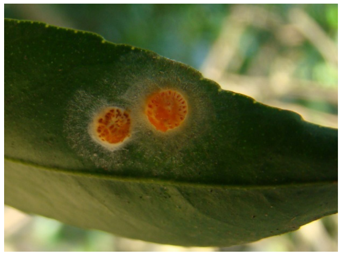
Fig. 1. Fungal growth of Achersonia aleyrodis on leaf surface