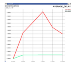
Figure 4. End-to-end delay.