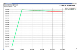
Figure 3. Average throughput rate.