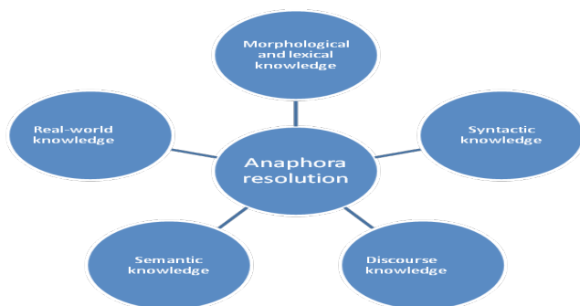
Figure 1. Ashima

The paper is assembled in following way: section 2 portrays the background. Section 3 portrays related work. Section 4 portrays research gaps .Section 5 portrays conclusion. Section 6 portrays references respectively.