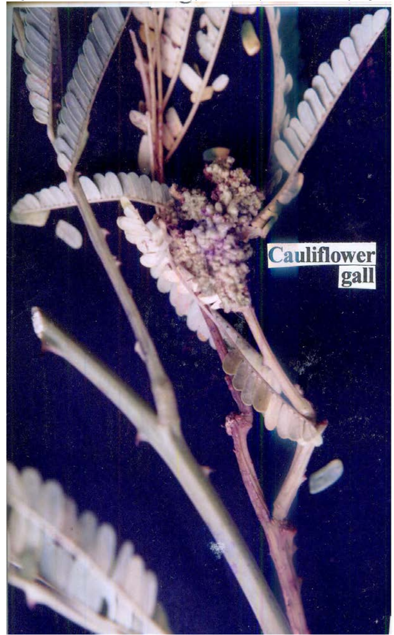
Figure 5. Acacia caesia W. & A. Gall Type – IV: Amorphous bunched leaflet gall

Gall Type – III (Figure 4): Sea urchin leaf gall (Cecidomyiidae) – A remarkable gall simulating the 'sea urchin' spherical, hypophyllous, gall studded with straight, rough, pointed vascularised bristles, one or more galls per leaflet, closely occurring, but not agglomerate, found adjacent to the midrib, green when young, pale yellow when old. The gall develops entirely from the mesophyll tissue which undergoes localized, proliferation forming abaxial invagination of spherical body with adaxialostiolar canal and central ovate larval chamber.