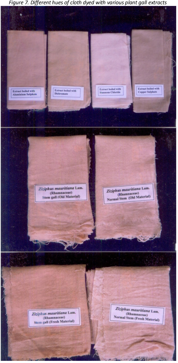
Figure 7. Different hues of cloth dyed with various plant gall extracts

The galls of Garuga pinnata, Morinda pubescens, Pistacea integirrima [13] [14] and Ziziphus mauritiana are used for making natural dyes and it is reliable vegetable dyes certified by Kalamkari unit of Kalakshetra Foundations, Thiruvanmiyur, Chennai. Apart from these studies galls are vital role to study ontogeny, callus culture and plant and insect interaction in a natural conditions (Figure 7).