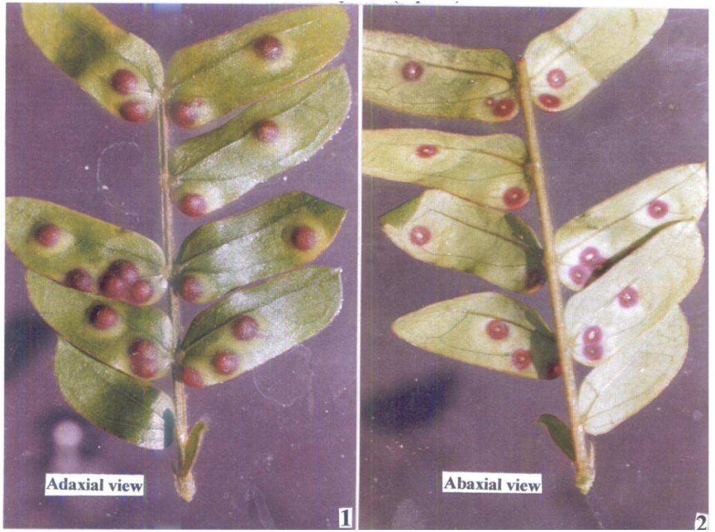
Figure 3. Acacia Caesia W. & A. Gall Type – II: Lenticular Purple Leaf Gall