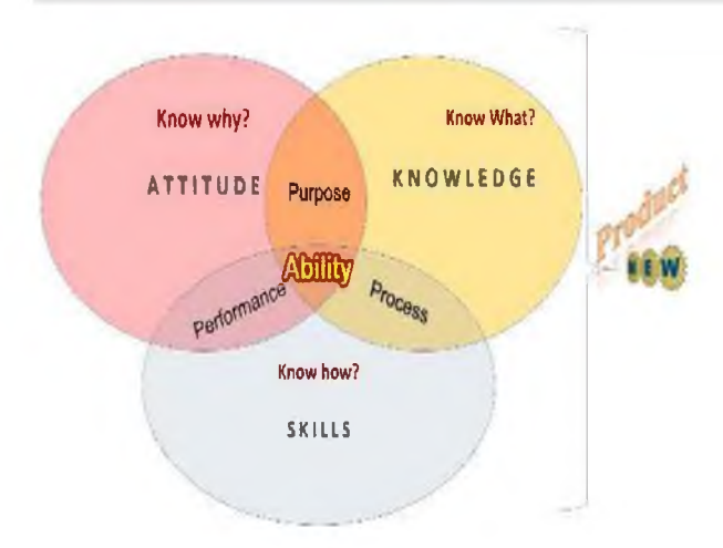
Figure 1: The 4P Ability Model

Competence can be explained using the 4P Ability Model, which sets knowledge skills and attitudes into a context of purpose, process and performance leading to the ability to produce a product according to certain industry standards. And this exactly is the ability to make the economy competitive and successful at national as well as occupational levels