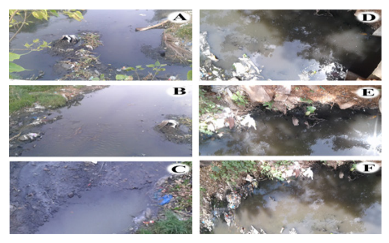
Figure 1. Breeding habitats of mosquito in the study areas EPO-1 (A, B, C) and EPO-2 (D, E, F).

Larval and pupal collections were made from 10 different breeding places from the beginning of January to December 2018. The survey was conducted at every site and sampling was done two times per month, in two weeks time interval. Sample collection in the morning was from 7 to 9 am and that in the evening was from 4 to 5 pm. Every juvenile collection started on the 7^{m} day (I Phase) and second larval collection (II phase) was on the 22^{na} day of every month. In total, 24 (12 x 2) juvenile collections per site were made in a year period and the adult emergence was recorded for sex ratio determination. Overall 72 larval-pupal samples were collected during the study period. Larvae and pupae were collected by means of handled larval nets, consisting of an iron ring (20 cm in diameter) to which a muslin sleeve (30 cm long) was attached. For the collection of mosquito larvae three methods, namely, dipping, netting and pipetting were commonly used.