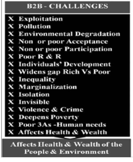
Fig.2: B2B - Challenges.

These challenges are common in majority of the B2B models with variance from inputs and outputs. In this the main focus is to sell their products / services to the consumer either directly or through various agencies and certainly not bothering what happens to the consumers after the use, or impact over the environment during the production. Sharing some part of the development with its employees adds their responsibility to be part of the challenges with better acceptance.