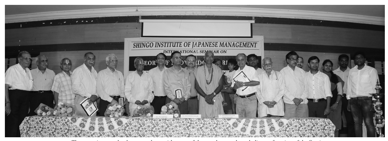
The organizers and volunteers along with some of the speakers at the valedictory function of the Seminar