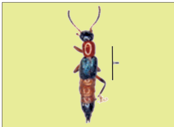
Fig. 5. Paederus fuscipes Curt.

1931. Paederus fuscipes : Cameron; The Fauna of British India, incl. Ceylon & Burma (Col.: Staphylinidae) 2: 40-41.