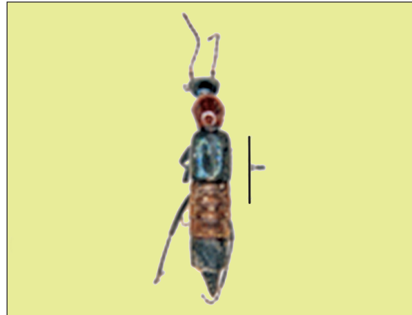
Fig. 3. Paederus pubescens Cam.

1995. Paederus pubescens Biswas & Biswas, Zoological Survey of India, State Fauna Series 3, Fauna of West Bengal , part 6(A): 274.