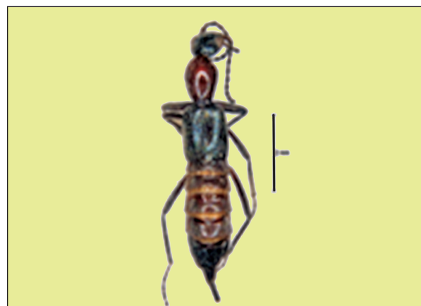
Fig. 1. Paederus atrocyaneus Champ

1927. Paederus atrocyaneus Champion, Ent. Month. Mag. , 63: 50.