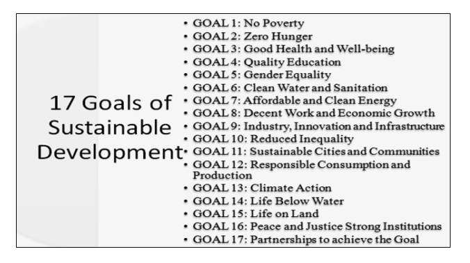
Fig.1: Seventeen Goals of Sustainable Development

In September, 2015 at Sustainable Development Summit, 2015, India along with other countries signed the declaration "2030 Agenda for Sustainable Development containing 17 Sustainable Development Goals (SDGs) focusing mainly on 5Ps: People, Prosperity, Peace Planet and Partnership (UN: RIS for Developing Countries, 2016).