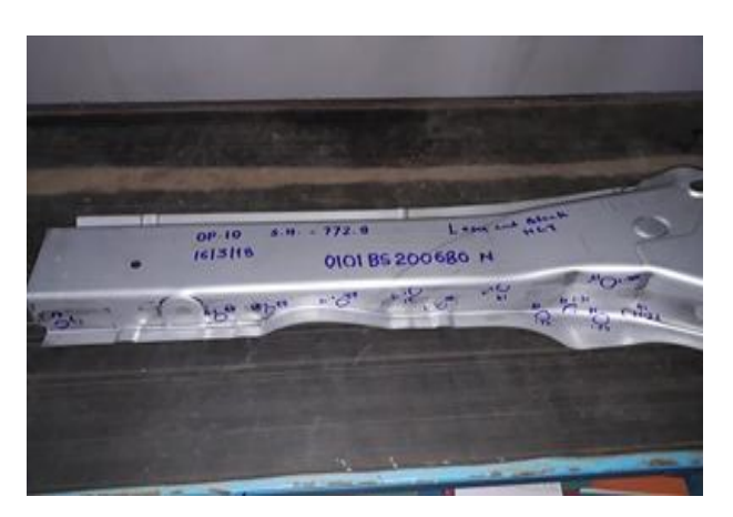
Fig. 2: Sheet metal parts of cars

The company under consideration manufactures inner body parts for the cars. These sheet metal parts are shown in figure 2. Each part requires spot welding for assembling the job. As discussed earlier, the task of spot welding of the metal sheets was carried out manually. The process is now carried out with the help of robots. The welding process / operation of making the parts in the company's project are operated by spot welding robots only. The company has a total of seven cells for the project where six cells are assigned for spot welding and one for CO<sub>2</sub> spot welding. Each cell contains two robots and multiple fixtures. Fixtures have the sensors which sense the proper position of metal parts during the welding process. Mimic model is used for getting the overview of the position of the welding spot on a particular part. Safety sensors are available to the cell, which protects the employees when the robot is in working condition. To identify the failures in the process, the process of FMEA implementation in the company has been discussed below.