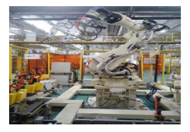
Fig. 1: Spot welding robot

The spot welding process carried out in the company is shown in figure 1. Some movements that are awkward for an operator, such as positioning the welding gun upside down, are easily performed with the help of this robot.