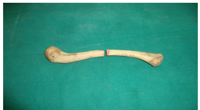
Fig. 1 Parasagittal cutting of clavicle

and left side were calculated by apply direct statistical formulas.