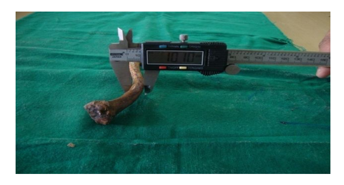
Fig. 3 Diameter at midclavicular point before cutting