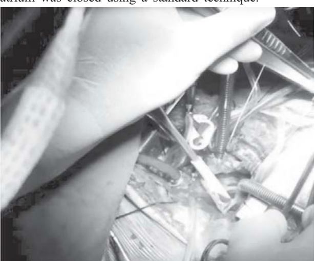
Figure 3 Intracardiac structures after opening of right atrium

One drop-in suckers was placed in the left atrium to maintain a bloodless operative field. Handheld retractor was used to expose the mitral valve ( Figure 2 ). Anterior mitral leaflet excised, complete preservation of posterior mitral leaftlet and submitral apparatus was done to maintain left ventricular geometry. A 27 ATS Medtronic prosthetic valve was seated. Rewarming was started at the time of tying the valve sutures. Prosthetic mitral valve leaflet mobility was checked. Deairing of left side of heart performed. The right atrium was closed using a standard technique.