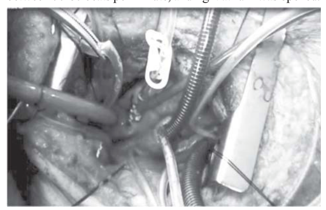
Figure 1 Rt anterior 4th intercostal space approach & on cardiopulmonary bypass

and thoracotomy was performed via right anterior 4th intercostals space. Cardiopulmonary bypass was initiated with aortic and bicaval canulation, and systemically cooled to 28 °C ( Figure 1 ). An aortic root vent needle was inserted and connected to vent sucker at 100 mmHg. The patient was placed in the Trendelenburg position. Patient's perfusion pressure was kept at 70 mmHg. Heart rate was maintained between 70-80 beats per minute, and right atrium was opened.