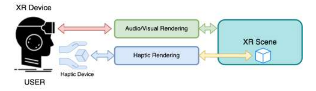
Figure 2. Basic Architecture of a XR application with haptic feedback

Haptic rendering is the process of calculating and applying force feedback to the user's haptic device directly from the virtual environment. The implementation of the haptic rendering technique depends on the application requirements. In [7], the authors classified the SHVE architectures in three major classes: static, collaborative, and cooperative shared virtual simulations and analysed two different approaches of haptic rendering: impulsive haptic rendering and continuous haptic rendering . In a cooperative virtual environment, users can simultaneously modify and interact with the same virtual object. In this paper, we will focus on the continuous haptic rendering in cooperative SHVE since it corresponds to the abovementioned mission-critical Tactile Internet application scenarios.