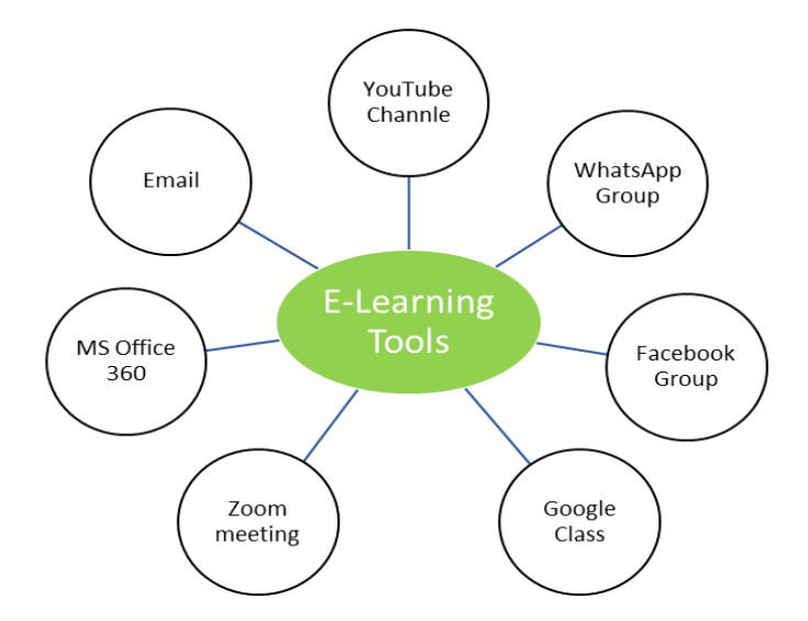
Figure 1: Shows some of the tools that used in E-learning.