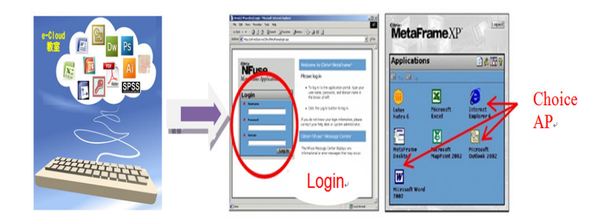
Figure 1. e-Cloud Classroom

In order to teach a specific application software or a computing-related course, a computer classroom has to be installed with a specific set of software. To teach a different course, a different set of software needs to be installed in a classroom. In the above case, a classroom serves a single purpose. In case an educational institute teaches a wide range of courses, that means many different computer classrooms need to be set up for the teaching purpose. Such an approach not only requires high cost, but also limits the use of a classroom to a specific course only. Thus, the project initiates a multi-purpose e-Cloud classroom concept (Fig. 1) so that the students can use a wide selection of software applications through the Internet and Web-based network applications. An e-Cloud classroom so configured can meet the requirements for teaching different courses with shared teaching resources to make sure that an educational institution provides high calibre learning environment and the teaching resources are fully utilized.