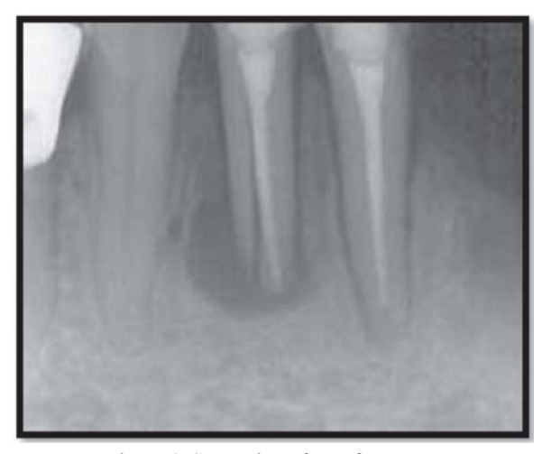
Figure 4: Separation of root fragments

evidence of a fracture can be seen as a vertical radiolucent line running across the root or the root filling. For the fracture to be seen the x-ray beam must pass almost directly down the fracture line. A four degree variation in the horizontal angulation of the film can prevent visualization of the fracture.<sup>8</sup>