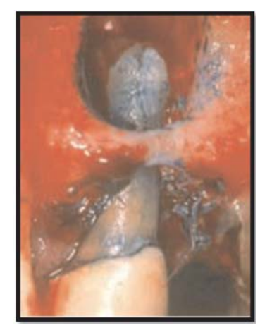
Figure 6: Methylene blue dye used to detect vertical root fracture under direct visualization

Direct observation of the fracture is the only sure way to confirm the presence of the fracture in many cases. Gentle retraction of the soft tissues in the region of the suspected fracture line with a flat plastic or other instrument (under anaesthetic if required) may be sufficient to view the fracture on the root surface. Location of the fracture can be assisted by passing a sharp probe lightly over the tooth surface. A 'clicking' sound can be heard as the probe is passed over the fracture line.<sup>4</sup> Where this is not possible, reflection of a small flap is recommended in order to view the root and confirm the presence of a fracture (Figure 6).