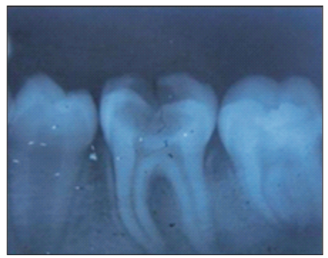
Figure 1: Pre-Operative IOPA radiograph