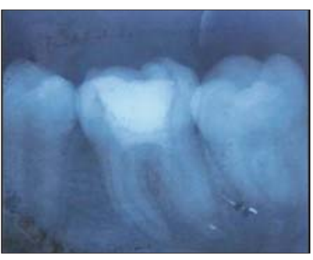
Figure 2: Follow up at 3 months after MTA pulpotomy