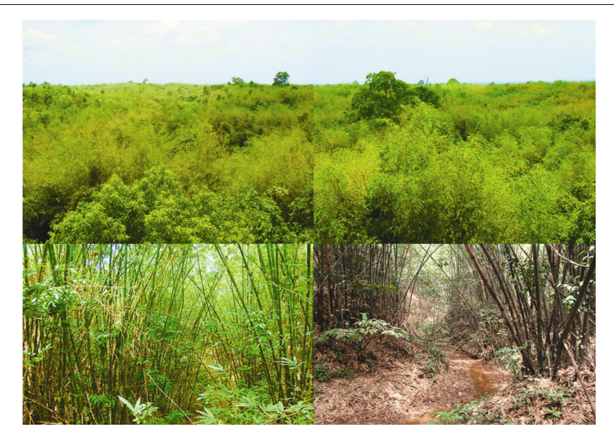
Figure 1. Bamboo invasion in the core area of Trishna Wildlife Sanctuary, Tripura, North East India.

been invaded by M. baccifera. It was also observed that only few seedling and saplings surviving in the forest gap that have been invaded by M. baccifera. In the absence of woody tree species regeneration, this area can develop into a bamboo forest. From a dietary point of view, a bamboo-dominated forest cannot provide foraging requirements of the primates. Moreover, in the absence of adequate number of trees, their activity can also be hampered. In a recent study from the lowland tropical wet forests of Costa Rica, reduction in the primate population was reported in the absence of adequate woody trees<sup>12</sup>. Therefore, the need of the hour is to control the existing and stop further bamboo invasion in TSW to conserve the globally threatened primate species. We propose two strategies to control bamboo invasion: (i) clear felling in heavily dominated bamboo sites and to plant primate preferred tree seedlings, and (ii) develop selective felling in a five-year cycle to control further bamboo invasion and for sustainable utilization of existing bamboo resources.