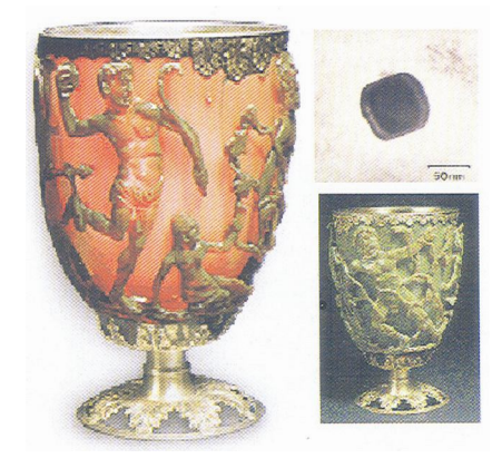
The Lycurgus Cup made of glass appears red in transmitted light and green in reflected light. The glass contains 70 nm particles as seen in the transmission electron micrograph. The cup itself is dated to 4th century AD, but the metallic holder is a later addition.

nanoparticles, dendritic nanostructures and hybrid systems have been discussed for the benefit of readers. Special attention has been drawn on a variety of topics, including molecular electronics, nanolithography, nanomagnetism, nanobiology, nanofluids for cooling technology, transition metal clusters catalysts, etc. Overall, the book has several commendable features and is informative. As this book is pedagogical in nature, I am sure it would stimulate more research and benefit the undergraduate teachers and students who are interested in nanoscience and nanotechnology. The strength of the book is that it introduces 15 experimental procedures that can be useful in designing an experimental course at the undergraduate level. Each chapter is provided with a few review questions that would help teachers and students to strengthen their understanding of the topic.