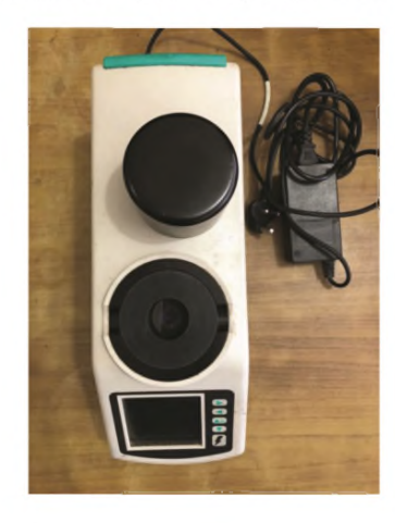
Figure 3. Colour meter.