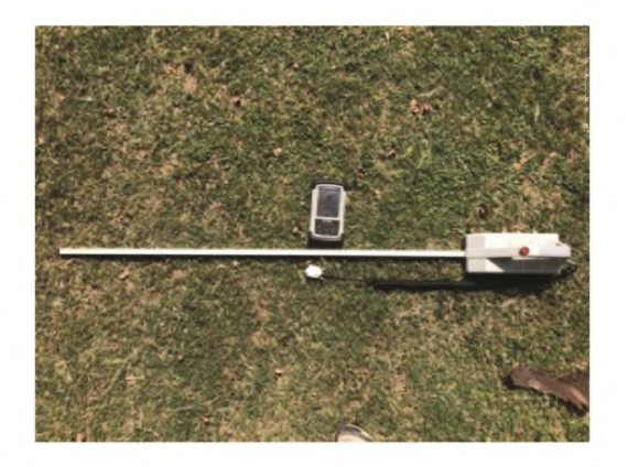
Figure 2. Quantum sensor (Sun Scan probe) used for measuring PAR.