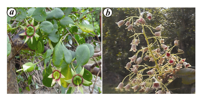
Figure 2. Globally threatened mangrove species of India: shoot branches with ( a ) flowers and fruits in Sonneratia griffithii ; and ( b ) inflorescence of Heritiera fomes .

India is a global leader in mangrove research and management. Our country is ranked third position in mangrove research publications, next to China and USA. Twelve per cent of the total publications on mangroves during 2000–2010 were from India, as against USA and China with 17% and 14% respectively. Among the top 10