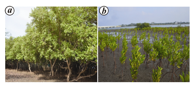
Figure 3. Mangrove restoration along the Vellar estuary, Tamil Nadu with (a) 15-year-old Avicennia marina; and (b) one-year-old Rhizo-phora mucronata.