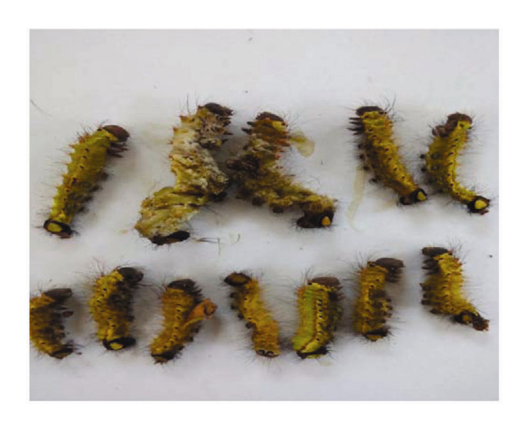
Figure 1. Flacherie-infected larvae of Antheraea assamensis caused by Aeromonas caviae CSB04.

spectrophotometer at 260 and 280 nm. The partial sequencing of the 16S rDNA gene was carried out through the courtesy of DNA sequencing service, Bioserve, Hyderabad, India. NCBI nucleotide blast result showed that, isolate CSB04 has 99% sequence similarity with Aeromonas caviae strain 75a and Neighbour-joining<sup>10</sup> phylogenetic tree multiple alignments after using CLUSTALW was constructed with the closest homologous group of bacteria obtained from NCBI blast (Figure 3). The identified gene sequence was submitted to NCBI GenBank and an accession number (KT982275) was obtained for