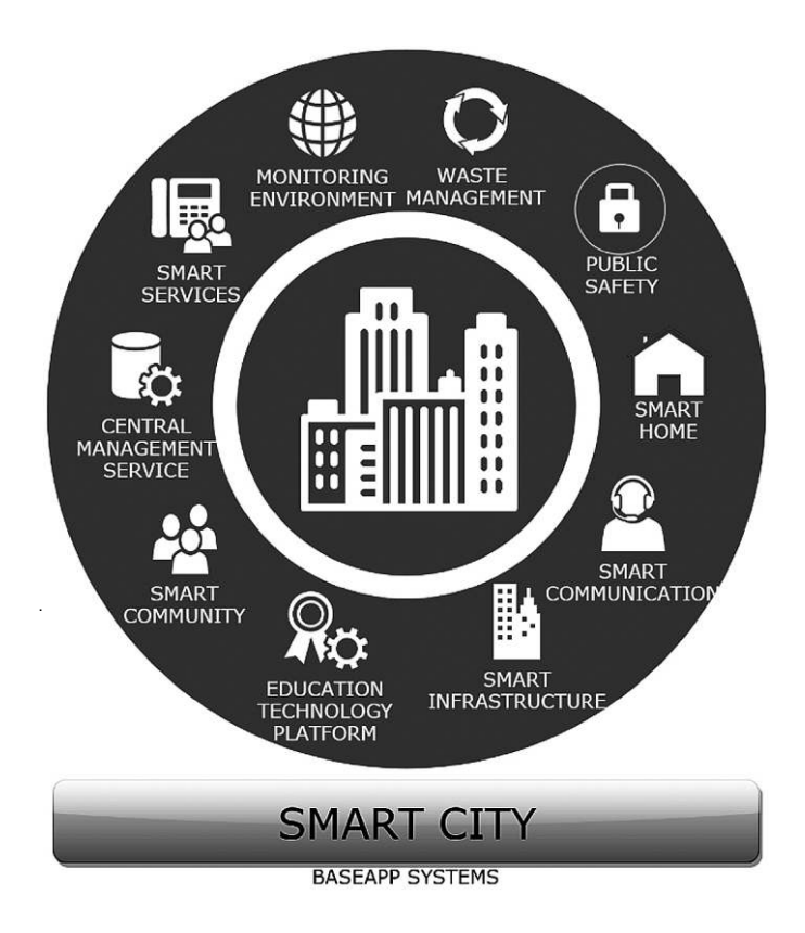
Figure 2: Smart City