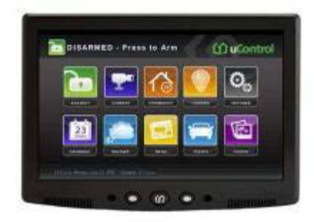
Fig 3: Control Home Security, Monitoring and Automation (SMA)[3].

the overall papers reviews, HAS according to [3-10] never mentioned about the existing physical electrical switches in their system. Without the switches on the wall, the designed system limited the control only at the GUI. This issue brings inconvenience to the people in the house. This designed system remains the physical switches with the modified low voltage activating method, in order to provide safer physical control to the user compared to the conventional high voltage switches. The Bluetooth connection in this system is established by Bluetooth module that directly receives/ transmits commands from/to smart phone or laptop/PC. For the GUI, Window OS on laptop/PC and Android OS on Smart Phone are chosen based on the high user distribution in current market. By considering the flexibility, the main control board is designed with wired and wireless connection. USB HID as secondary connection to the control board performs the wired connection. For the wireless connection, the main control board can be connected to either one of the laptop/PC or Smart Phone. Besides, the switches status on the board is synchronized in real time to all the connected GUI controllers. In terms of cost, this system implemented low cost microcontroller and Bluetooth module as the system main core. The total cost of one unit of this system hardware is estimated less than 30 USD. With this low budget, this system is still performed with powerful remote functions to make our life in home easier.