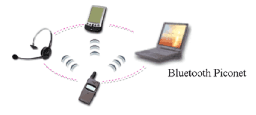
Figure 1: Bluetooth topology showing how a piconet is created

The Bluetooth SIG includes promoter companies 3Com, Ericsson, IBM, Intel, Lucent, Microsoft, Motorola, Nokia, and Toshiba, along with over 2000 Adopter/Associate member companies.