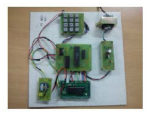
Fig 6: Microphone circuit board with Zigbee module and voice recognition unit.

The human voice is captured through micro phone. It is matched with the voice previously recorded in HM 2007. If it matches the corresponding signals are sent through Zigbee. Here HM 2007 is the voice recognition unit. Figure 6. shows the circuit board for microphone and voice recognition unit. On this board voice is recorded and saved and then recognized whenever a command is given through microphone. The speech recognition system is completely assembled and easy to use programmable speech recognition circuit. Programmable, in the sense that you train the words (or vocal utterances) you want the circuit to recognize. This board allows you to experiment with many facets of speech recognition technology. It has 8 bit data out which can be interfaced with any microcontroller for further development. Some of interfacing applications which can be made are controlling home appliances, robotics movements, Speech Assisted technologies, Speech to text translation, and many more. Once the speech commands are recognized, control characters are sent to the specified appliance address through ZigBee communication protocol. Each appliance that has to be controlled has a relay controlling circuit.