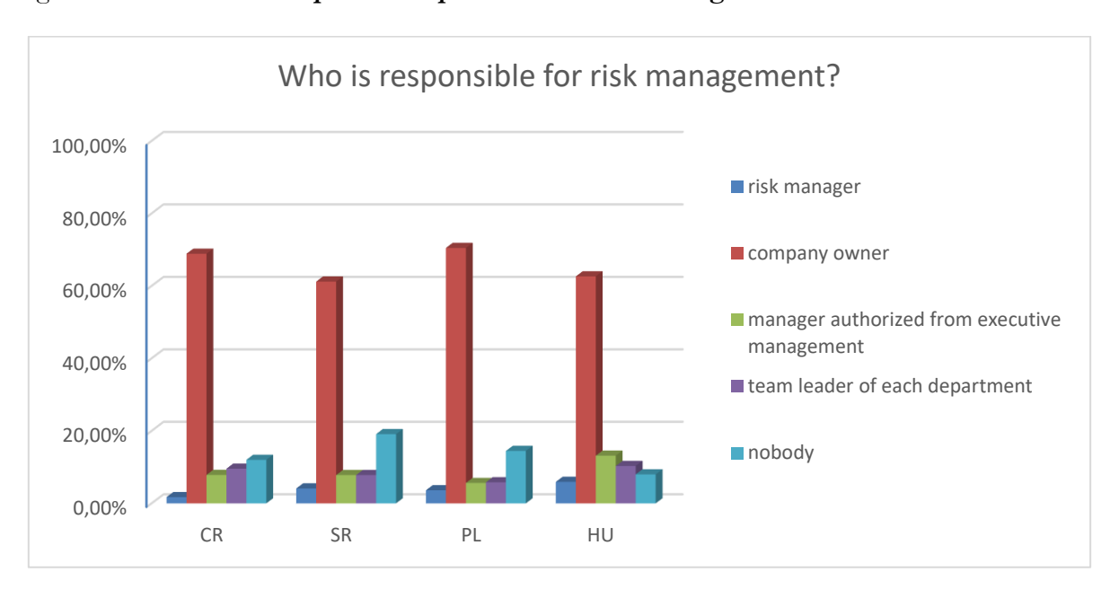
Figure 2 An overview of a person responsible for risk management in SMEs in V4 countries

The second research question was aimed at a person responsible for a risk management in the company and to the differences among countries as well. Fig. 2 shows an overview of the situation in companies in V4 countries. The situation is almost similar. The most common is a situation when the person responsible for a risk management is company owner (CR 69%, SR 61%, PL 70%, HU 62%). It can mean that the company has not discussed the risks in the company yet. Some of the small and medium companies state that there is nobody responsible for risk management (CR 12%, SR 19%, PL 14%, HU 8%). A manager authorized from the executive management is often used as a team leader of each department (CR 8%/9%, SR 8%/8%, PL 6%,6%, HU 13%/10%). A risk manager specialized in this activity is still a rare situation in V4 countries (CR 2%, SR 4%, PL 4%, HU 6%). Hungary with 6% is a little bit further in the risk management concept in comparison with other V4 countries.