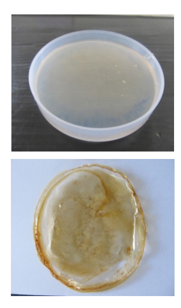
Figure 2. Chitooligosaccharide mesh graft preparation.

The addition of chitooligosaccharides provides an additional amino group which function as binding sites to increase the GA collagen cross-linking efficiency. Hence, the collagen and chitooligosaccharide is crucial<sup>24,25</sup> good combination for developing as a wound healer. GA was used in the preparation to improve their bio stability.