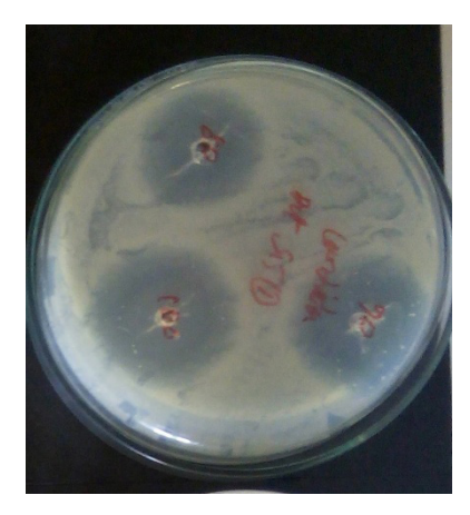
Figure 1. Antimicrobial activity of chitooligosaccharides against Candida sp by well diffusion method.

The chitooligosaccharides prepared from the enzymatic hydrolysis with chitosanase was checked for its antimicrobial activity against E, coli, S. aureus, Pseudomonas sp, and Candida albicans. The chitooligosaccharide prepared at the 180 min showed to have the antimicrobial activity and were then subjected to check its antibacterial activity at concentration of 100 \mu l of 1 mg/ml against foot ulcer pathogens (Table 1).