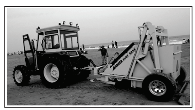
Fig. 4. Puri Sea Beach Cleaning Equipment

Since absenteeism is high in a daily wage condition, backup plan becomes necessary. If the actual work is for 40 workers, 50 workers have to be requisitioned but, sometimes, extra labourers turn up, and they have to be deployed in some extra work such as conservancy line cleaning (cleaning work for bush cutting between two rows of quarters) etc. Government health officers monitor the activity and finally measure the weight of the garbage collected.