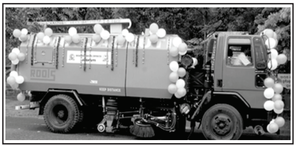
Figure 3. Jagruti Mechanised Road Sweeping Machine